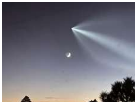
The Falcon 9 second stage accelerating into orbit over the moon

I was curious why it appeared so large and high in the sky. Vandenberg is 500nm to the west in California, and most launches from there are "polar", meaning they fly mostly south from there. But these more recent Starlink missions are on the same 53 degree orbital inclination they fly from Florida. The launch track carries the rocket closer to Mogollon during the flight than at launch. In order for the Falcon 9 first stage to land at sea, the rocket flies a "dog leg" maneuver that avoids Los Angeles. Here's a link with more details on a Dec 17, 2021 flight on the same track: