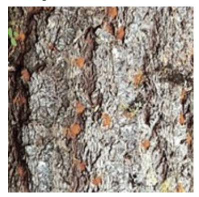
Boring Dust on Infested Tree